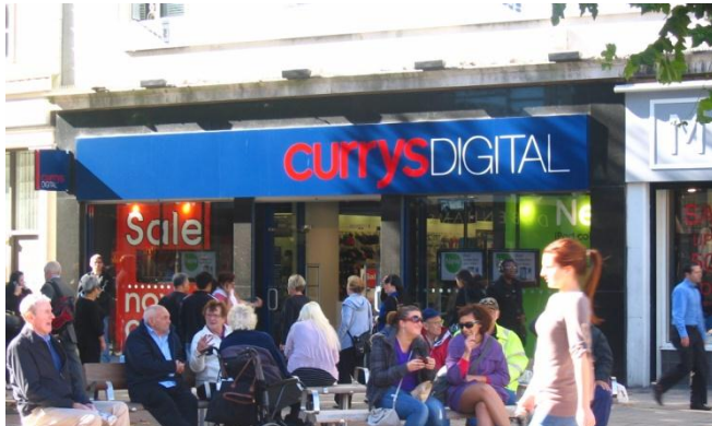
109 Commercial Road, Portsmouth

Let to DSG Retail Group t/a Currys Digital from 29 th September 2009 to 28 th September 2014 Forecast initial income return 5.95%