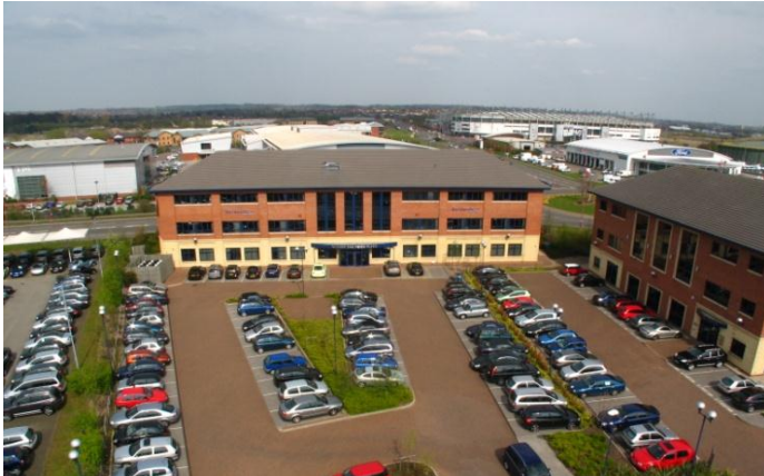
Pride Park, Derby

Let to Edwards Geldard LLP from 3 rd July 2003 until 2 nd July 2023 37% loan to value which has been fully repaid in first 7 years (ahead of forecast due to low base rate). Year 7 forecast income return 10.5%